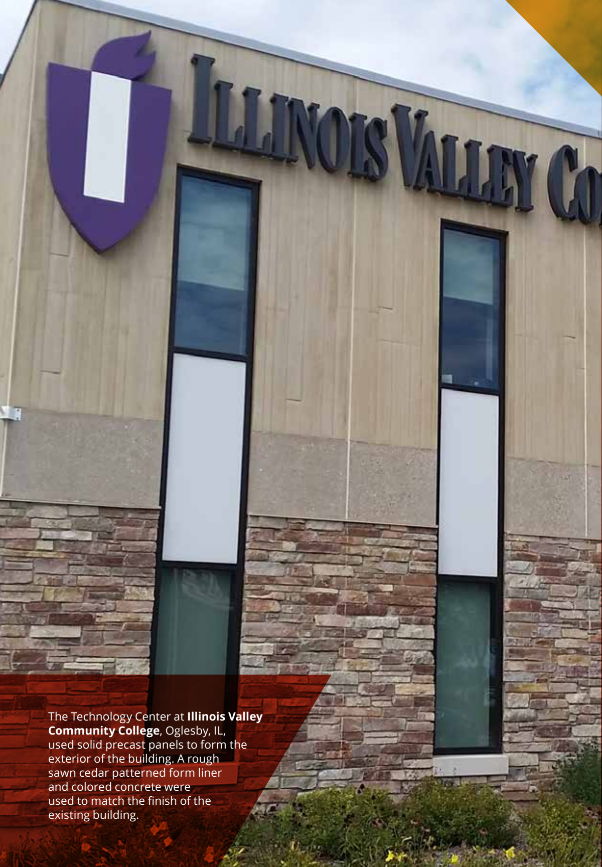
The Technology Center at Illinois Valley Community College , Oglesby, IL, used solid precast panels to form the exterior of the building. A rough sawn cedar patterned form liner and colored concrete were used to match the finish of the existing building.