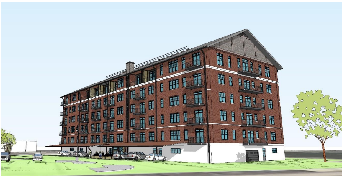
Rendering courtesy of JLA Architects.